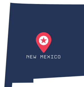
New Mexico Grant