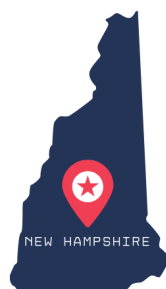
New Hampshire Grant