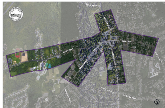
Town of Shrewsbury Comprehensive Transportation and Multimodal Study

The Town of Shrewsbury announces the start of a Comprehensive Transportation and Multimodal Study also known as the Town Center Multimodal Study. The Town Center Multimodal Study will identify strategies that would accommodate active transportation modes while supporting local commerce and economic development opportunities; and improving safety and comfort for all users. The Town Center Study will